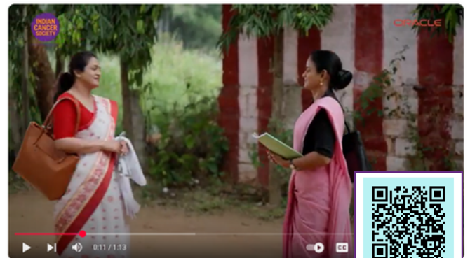
A Teacher becomes a student!