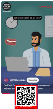
Animated video for Oral Self Examination in Kannada

Excited to share that we have created six videos for cancer awareness this year. Two of which are made in animation style! The content of these videos was checked and reviewed by oncologists, communication experts and by end users. Available on our youtube channel, please scan the codes below to watch them. And while you are there don't forget to like and share forward to support our mission of cancer awareness. Thank you!