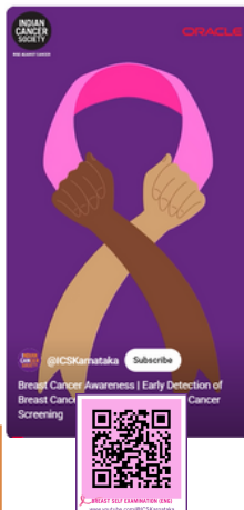
Animated video for Breast Self Examination in English