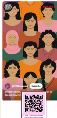
Animated video for Breast Self Examination in Kannada