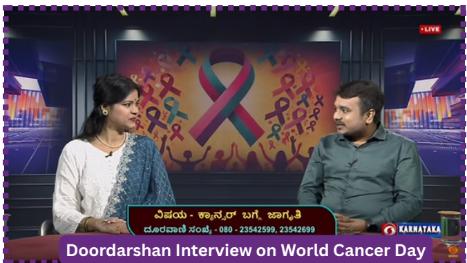
Doordarshan Interview on World Cancer Day