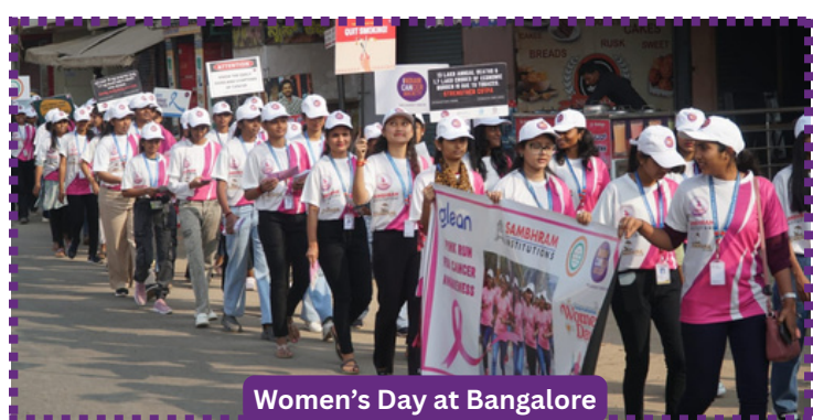
Women's Day at Bangalore