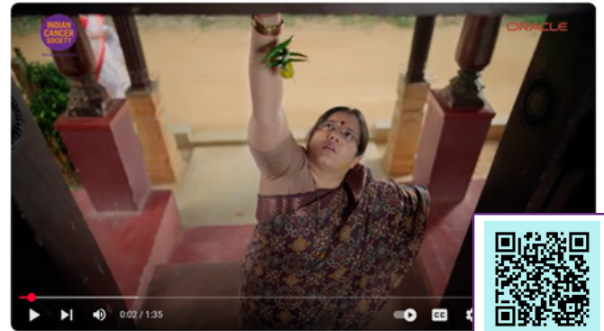
A doctor explains to a housewife why Pap smear tests are vital for cervical cancer detection