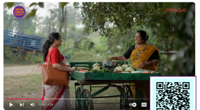
A vegetable selling lady understands a critical factor in her small business - her own health!