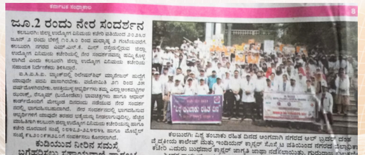
Media Coverage in Kalaburagi