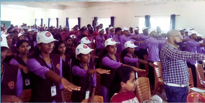
Anti Tobacco pledge by students of Dayanand Pai/ Sathish Pai Govt First Grade College, Mangaluru