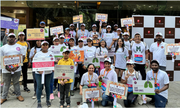
ICS Team, Oracle & Rubrik Volunteers and Runners during the TCS10K Run in Bengaluru created awareness using placards & posters