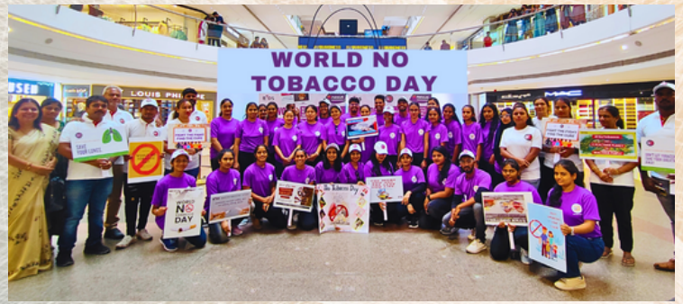
Anti Tobacco Awareness by ICS, Bengaluru and Bangalore Institute of Dental Sciences students at Nexus Mall, Koramangala.